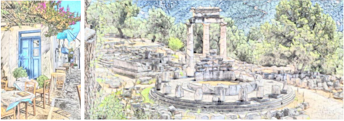
Figure 2. Greek Themed Café and Amphitheatre

Farm House Susu Lembang is known as a tourist destination which offers scenery of Europe, the concept that already there can be changed using the theme of a different country. For example, if Greece, tourists can borrow greek god-style costumes complete with a gold crown. It can also be supported with suitable food sales, such as Kokakia. Farm House Susu Lembang also can give colour to the walls by white and blue like houses in Greece. And for a spot around the "Rumah Hobbit" that most attracted, can add with artificial ruins Odyssey.