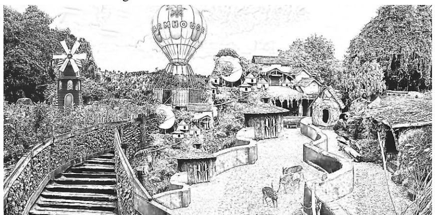
Figure 1. Farmhouse with Rural Europe Theme

Farm House became one of the popular places in Bandung since 2015, but until now not occurred any significant changes in concept that carried. There is only one model of costumes can be hired to take pictures and not replacement on the menu foods. The painting on the wall is still the same, even reduced the animals that can be seen. The absence of these changes led to tourists who had been visited the Farm House will no longer have the desire to make a return visit.